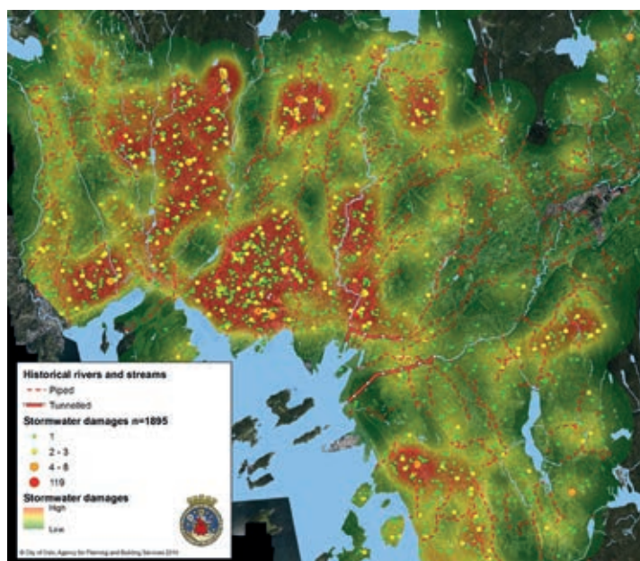
Figure 1: Map of Oslo, Norway – the location of stormwater damages and rivers

A public-private partnership between Finance Norway and ten Norwegian municipalities demonstrated a successful initiative to share claims data on an asset level from the insurance industry with local government 24 . The collaboration involved Finance Norway, insurers, Western Norway Research Institute, the Department of Geography at the Norwegian University of Science and Technology (NTNU) and ten municipalities 25 . Through opening conversation between insurers and municipalities the project encouraged the building of trust. 10 years of claims data at near 100% of market share was shared with municipalities who then mapped the information. This helped to better inform municipality and county councils of their risk to both river and urban flooding, highlighting areas at risk that previous local government information did not capture.