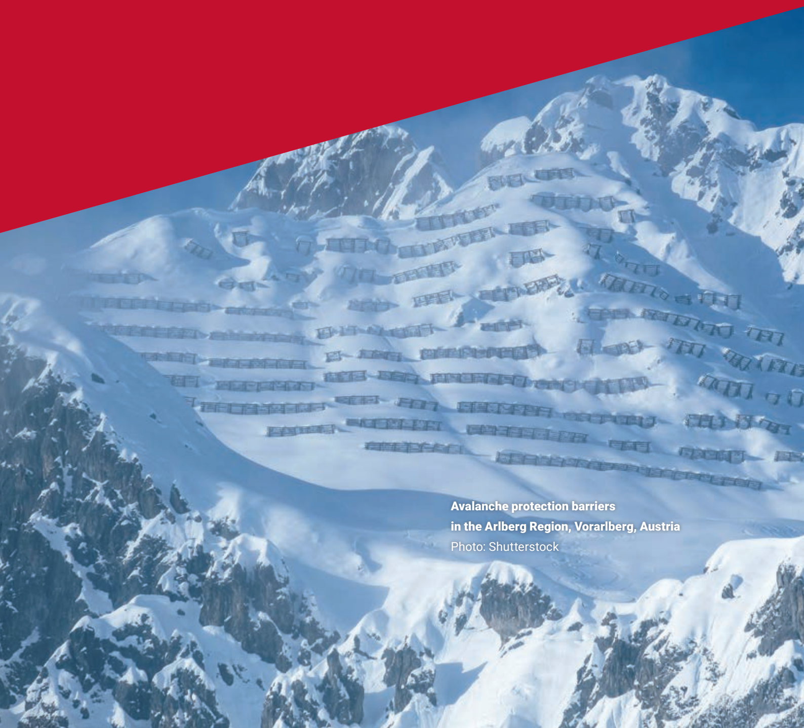
Avalanche protection barriers in the Arlberg Region, Vorarlberg, Austria